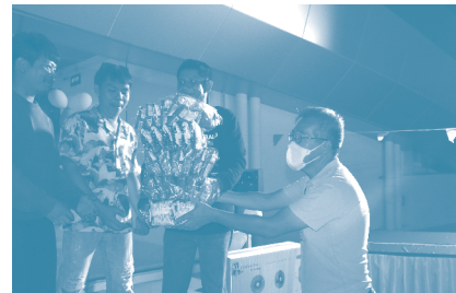
Year End Party in Thailand

The Group attaches importance to talents, we are committed to providing promotion opportunities for capable people, thus forming a good guidance of selecting employees and institutional environment. We conduct annual review of the performance of our employees for determining the level of bonus, salary adjustment and promotion of our employees. The Group recruits employees from the open market through posting of advertisements online or internal referrals by our other employees. We believe that the above arrangement can maintain a good relationship with our employees as we believe that our employees are valuable assets to our Group.